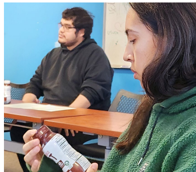
MIKE Mentors introduced a delicious activity for students to analyze food nutrition labels, inspired by the Oregon Dairy Nutrition Council. Students compared two chocolate milk options for added sugar, protein and calcium.