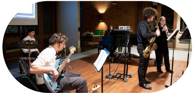
Musical entertainment was provided by the Lincoln High School Jazz Combo.